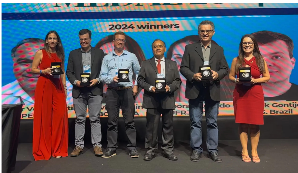
Winners of the BrMASS – Manuel Riveros Medal.