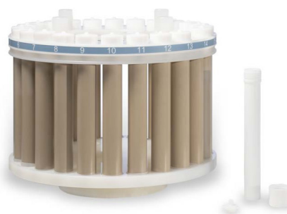
Figure 2. MAXI-24 HP Rotor