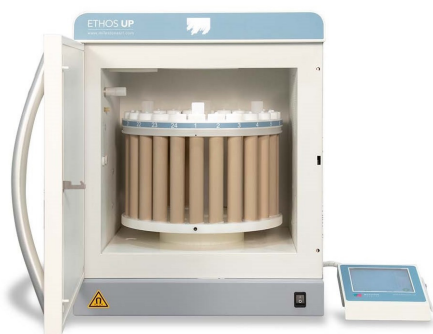
Figure 1. Milestone's ETHOS UP

The ETHOS UP is the most advanced microwave sample preparation equipment. It meets the requirements of modern analytical labs.