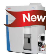
Thermo Scientific™ iCAP™ RQ ICP-MS