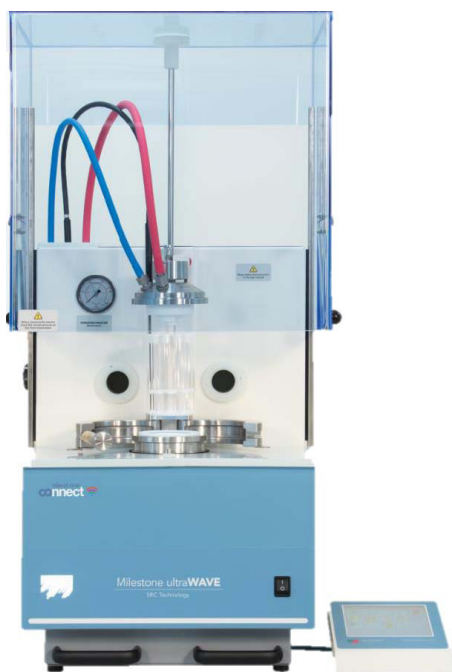
Figure 1. Milestone’s ultraWAVE.