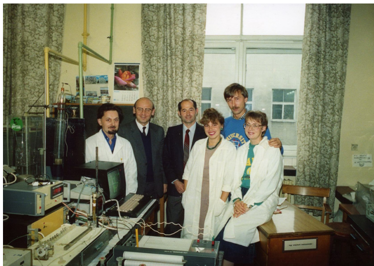
During PhD at the Laboratory of Flow Analysis and Chromatography at the Faculty of Chemistry, University of Warsaw, Poland (1990).