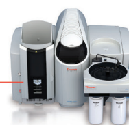
Thermo Scientific™ iCE™ 3000 Series AAS

• powerful solutions at thermofisher.com/TEA