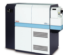
Thermo Scientific™ ELEMENT 2™ & XR™ HR-ICP-MS ELEMENT GD™ PLUS GD-MS