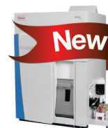
Thermo Scientific™ iCAP™ RQ ICP-MS