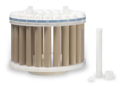
Figure 2. MAXI-24 HP Rotor