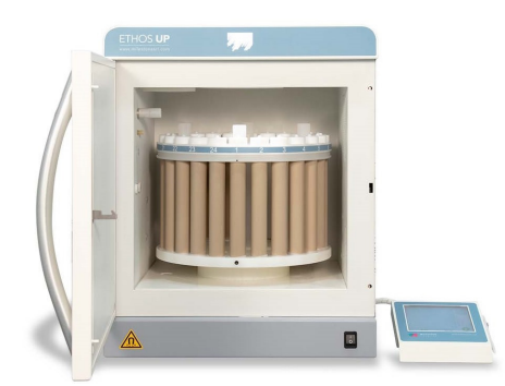
Figure 1. Milestone's ETHOS UP

The ETHOS UP is the most advanced microwave sample preparation equipment. It meets the requirements of modern analytical labs.